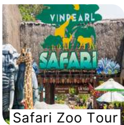
Safari Zoo Tour

Meals Breakfast at hotel Lunch at local restaurant Dinner at Sea Food restaurant