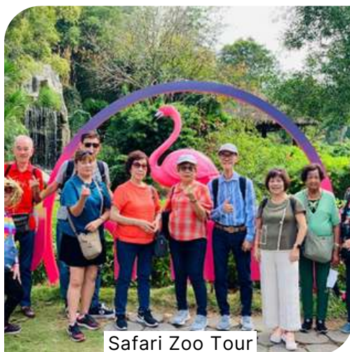
Safari Zoo Tour