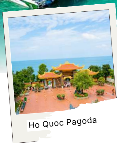
Ho Quoc Pagoda